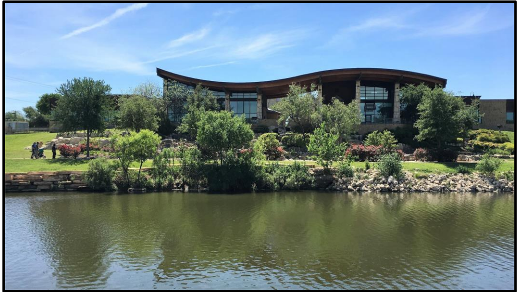
San Angelo Visitor Center located at 418 West Avenue B in downtown San Angelo